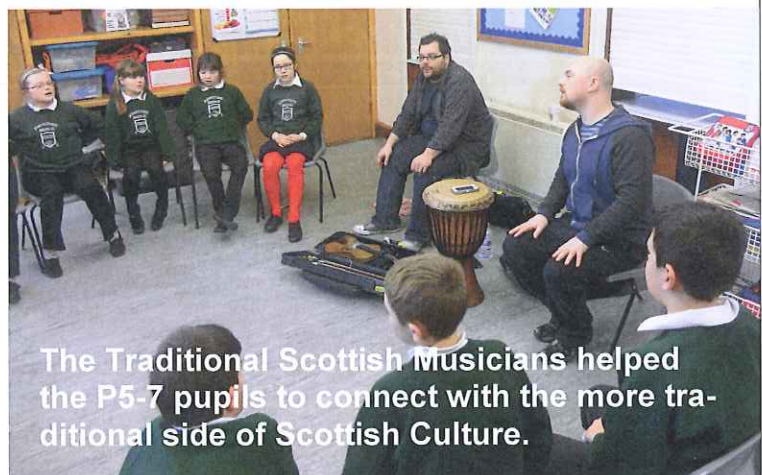
The Traditional Scottish Musicians helped the P5-7 pupils to connect with the more traditional side of Scottish Culture.