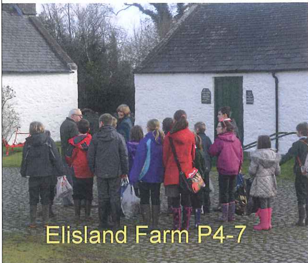
Elisland Farm P4-7